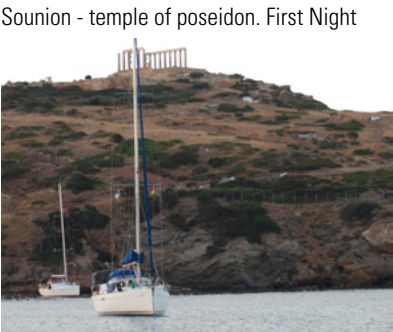
Sounion - temple of poseidon. First Night