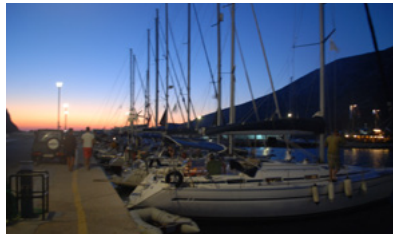
Sirifos: The best marina. Local Wine. Free bath. Going to Applonia - Loosing & finding iPhone.