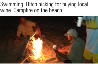
Swimming. Hitch hicking for buying local wine. Campfire on the beach.