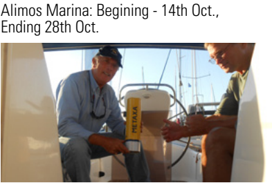
Alimos Marina: Beginning - 14th Oct., Ending 28th Oct.